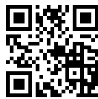
register with us