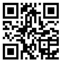
get the right help