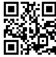
get the right help